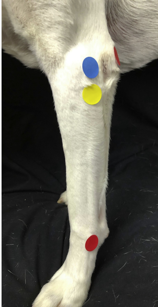
Fig. 7. Lateral aspect of the left canine elbow and antebrachium. Proximal red: olecranon of the ulna; blue: lateral epicondyle of the humerus; yellow: head of the radius; red: styloid process of the ulna.

The supraspinatus muscle lies cranial to the spine of the scapula and inserts on the greater tubercle of the humerus. Sporting dogs that overwork their shoulder by applying torsional stresses around the shoulder joint with rapid turning and pivoting seem to be at risk for injuring the supraspinatus tendon. 35,36 The tendon may feel firm and fibrotic with pain on shoulder flexion and palpation when compared with the contralateral limb. If untreated, the tendon is susceptible to develop chronic changes and calcification. Inflammation of the supraspinatus tendon can cause painful impingement of the biceps tendon. Flexion and internal rotation of the shoulder increase the amount of impingement and discomfort associated with this disease.