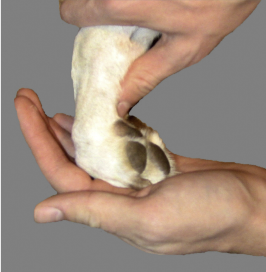
Fig. 1. Flexion of the canine digits.

surface of the distal phalanges of the digits, respectively. 15 Flexor tendon injury most commonly affects the deep digital flexor tendon because it is more superficial at the level of the metacarpophalangeal joint and results in a dropped toe (hyperextension of the distal interphalangeal joint). 16 The nails of affected digits can be excessively long because they are not worn while the dog is walking. Valgus deformities of the digit are rare but can occur secondary to immune-mediated conditions (eg, rheumatoid arthritis) and give the appearance that the foot is externally rotated.