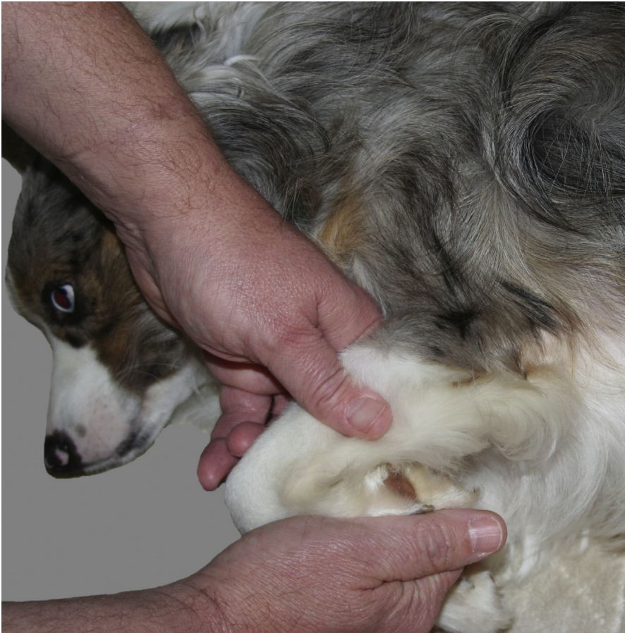
Fig. 3. Flexion of the canine carpus.

(antebrachiocarpal), middle, or distal (carpometacarpal) carpal joint, so any asymmetry between the carpi should be noted. If suspected, stress radiographs should be obtained.