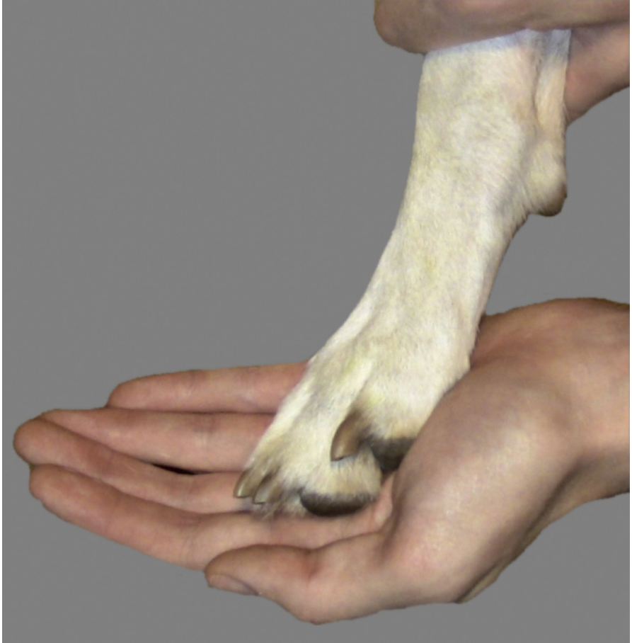
Fig. 2. Extension of the canine digits.

when the carpus is fully flexed. Often, older dogs will have a minor loss of flexion; however, this is usually not clinically relevant because dogs do not fully flex their carpus for normal daily function. Carpal hyperextension injury, with damage to the palmar fibrocartilage and carpal ligaments, occurs secondary to a jump, fall, or degenerative process. 19 Affected dogs have increased joint extension ( >200^\circ at a stance), and often soft tissue swelling, joint effusion, and pain on manipulation of the carpus. If suspected, stress radiographs should be obtained. Special attention should be paid to the carpus of 4- to 7-month-old dogs to evaluate for carpal laxity syndrome and carpal flexural deformity. 20