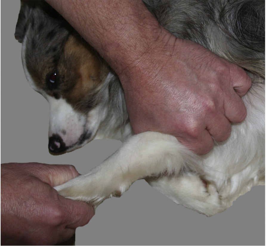
Fig. 4. Extension of the canine carpus.

pain and a firm swelling at the distal medial aspect of the antebrachium, suggestive of stenosing tenosynovitis. 21