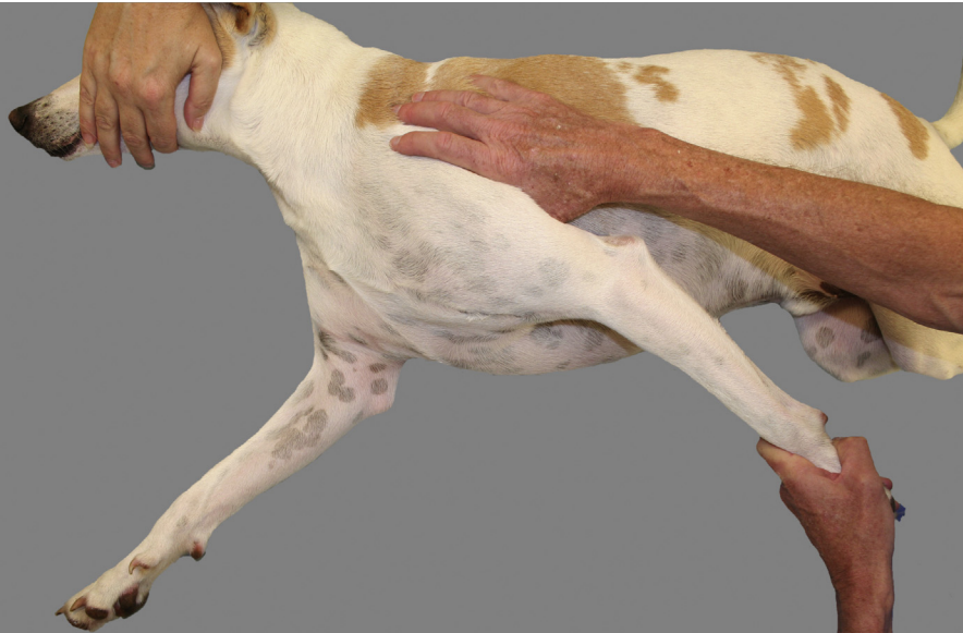
Fig. 8. Biceps maneuver.

Both structures are intraarticular and cannot be directly palpated. Historically, measurement of the shoulder abduction angle, the angle between the spine of the scapula and the lateral brachium during extension of the shoulder and elbow, has been recommended to diagnose MSI ( Fig. 9 ). 37 If the shoulder is not extended, the angle of