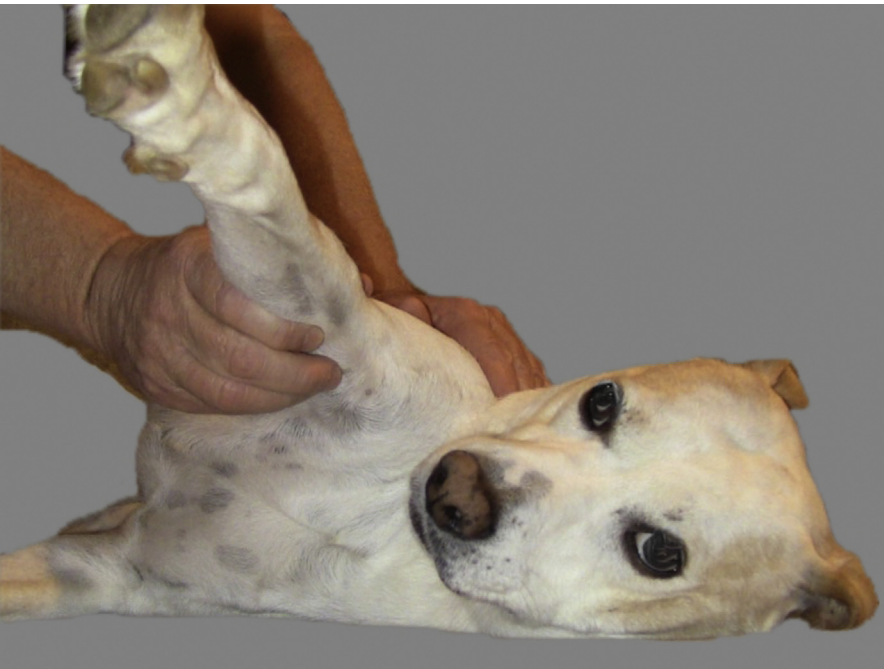
Fig. 9. Shoulder abduction.

Both structures are intraarticular and cannot be directly palpated. Historically, measurement of the shoulder abduction angle, the angle between the spine of the scapula and the lateral brachium during extension of the shoulder and elbow, has been recommended to diagnose MSI ( Fig. 9 ). 37 If the shoulder is not extended, the angle of